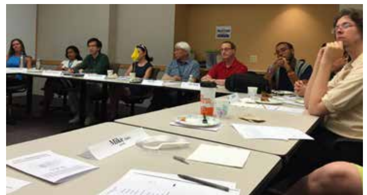
Top and below: Members of AT&T Middletown Toastmasters at the club's 15-year anniversary celebration and club meeting.